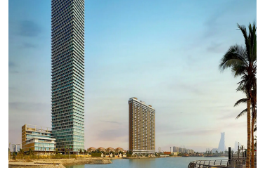
Middle East Saudi Arabia Shangri La Jeddah Sea View Room

Contemporary luxury hotel located along the shores of the Red Sea.